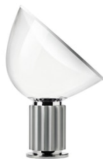
Table lamp providing indirect and reflected light. Reflector in painted aluminium, gloss white on the outside and matt white on the inside. Directionable diffuser in transparent PMMA. Body in matt black or naturally anodized extruded aluminium. Base in nickel-plated metal. Electric cable of useful length 220 cm, with dimmer switch for ON/OFF and adjustment of the light flow between 10-100%. Plug-in power supply with interchangeable plugs.

Designed by Achille and Pier Giacomo Castiglioni